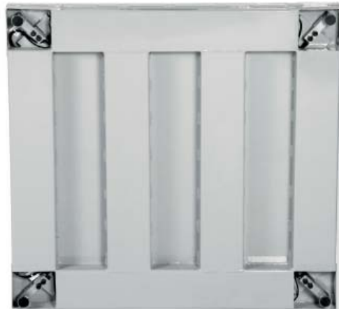
Wide channel design for superior durability