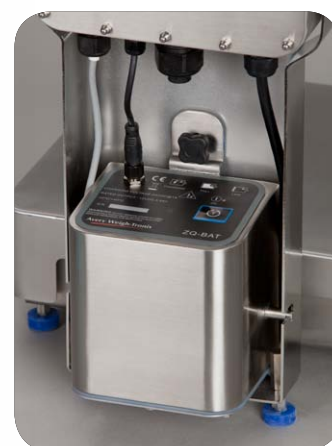
IP69K External Battery Pack Mounts neatly inside column. Toggle on/off. Rechargeable. Provides 16 hours operation.