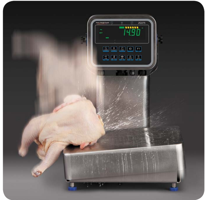
Torsion base features 500% shock loading protection

Able to withstand up to 500% shock loading, our breakaway load transfer system helps to guarantee accuracy and reliability at all times. This specialized base automatically transfers shock loads and overloads away from the load cell back to the base frame, ensuring that the scale's accuracy and performance is not affected. Unlike other designs used to reduce shock loading, this food grade stainless steel design offers a clean and uncomplicated solution that is fully NSF Certified and washdown resistant.