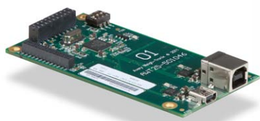
USB Device Card Provides USB interface to PC.