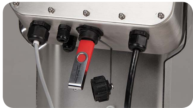
USB with optional waterproof gland