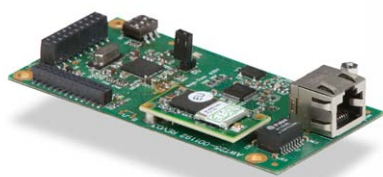
Wireless Card & Antenna Kit 802.11b/g wireless