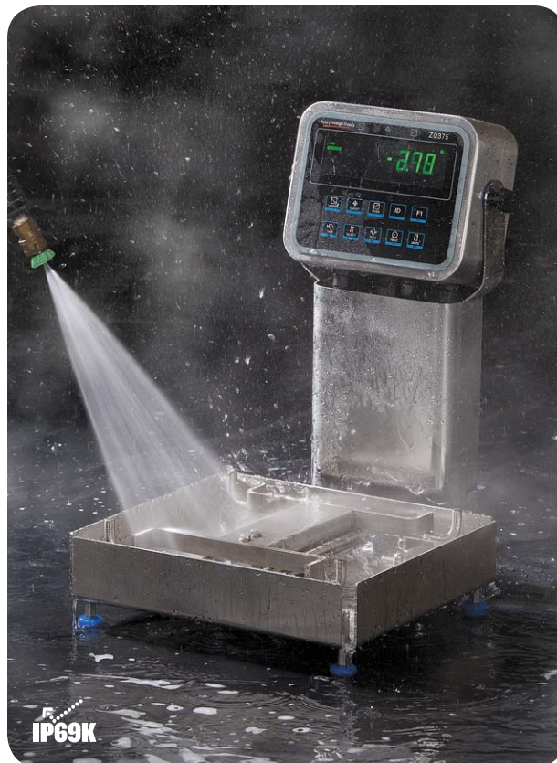
Easy to remove base cover for thorough cleaning

We recognize that good hygiene is vital to business success in the food industry. In line with USDA and other sanitation and hygiene standards, this NSF certified piece of equipment guarantees hygiene safety at all times. The ZQ375 has been designed for ease of cleaning. A smooth pickled and polished surface finish helps to stop microorganisms from growing on the surface of the scale. Curved corners and the easy-to-remove cover make thorough cleaning simple, fast and effective, minimizing food trap areas where bacteria could thrive. All threads are hygienically covered with domed nuts to aid and speed up cleaning processes.