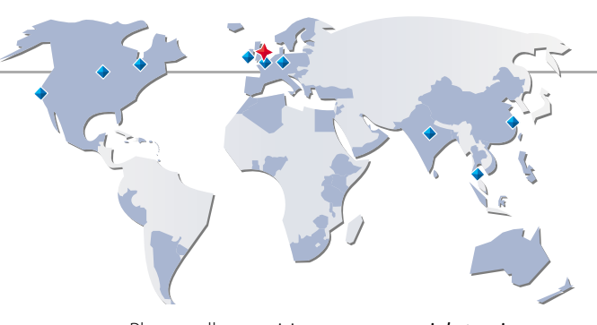
Please call us or visit www.averyweigh-tronix.com for your nearest Avery Weigh-Tronix distributor

Foundry Lane, Smethwick, West Midlands B66 2LP UK info@awtxglobal.com Phone: +44 (0) 8453 66 77 88 Fax: +44 (0) 121 224 8183